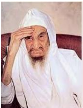
The Baba Sali

Rabbi Elazar said: The light that the Holy One, blessed be He, made on the first day of Creation was not that of the sun but a different kind of light, through which Adam could observe from one end of the world to the other. But when G-d looked upon the generations of the Flood and the Dispersion and saw that their ways would be corrupt and that they might misuse this light for evil, He arose and concealed it from them. And for whom did He conceal it? For the righteous people in the future, as it is stated: “And G-d saw the light, that it was good” (Gen. 1:3), - “good” referring to none other than the tzadikim (perfectly righteous people). (Talmud Chagiga 12a)