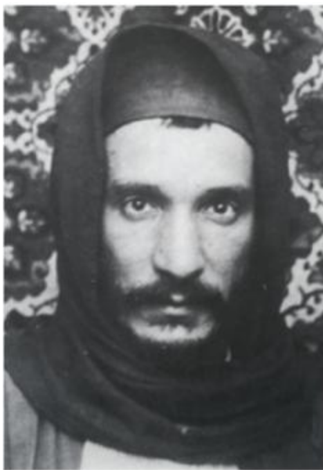
A photo of the Baba Sali In his younger years

During his stay in Tsfat (Safed) in 5683 (1923), my father [the Baba Sali ] made discreet inquiries about which talmidei chachamim (Torah scholars) were in need of receiving tzedakah (charity).