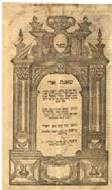
The title page of the classic sefer “The Shaagat Aryeh”