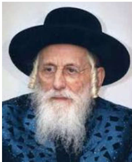
Rav Shlomo Halberstam, zt'l

About a year before he passed away, the Bobover Rebbe, Rav Shlomo Halberstam, zs"l, became so ill that the rumor spread that he had already passed away. The Rebbe's physician, who was a religious Jew, spent many hours at his bedside. He tried everything medically possible to cure the Rebbe, but to no avail. As he walked out of the sickroom to where the Hasidim anxiously waited for news of their Rebbe's condition, he was disheartened.