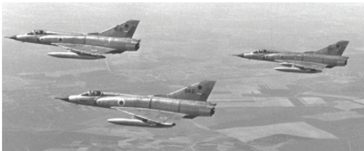
Israeli Air Force fighter mirage jet planes during the 1967 Six-Day War.

In our class this past Shabbat on Yom Yerushalayim, we were discussing the miracles of the 6-day War and ventured into the Yom Kippur War.