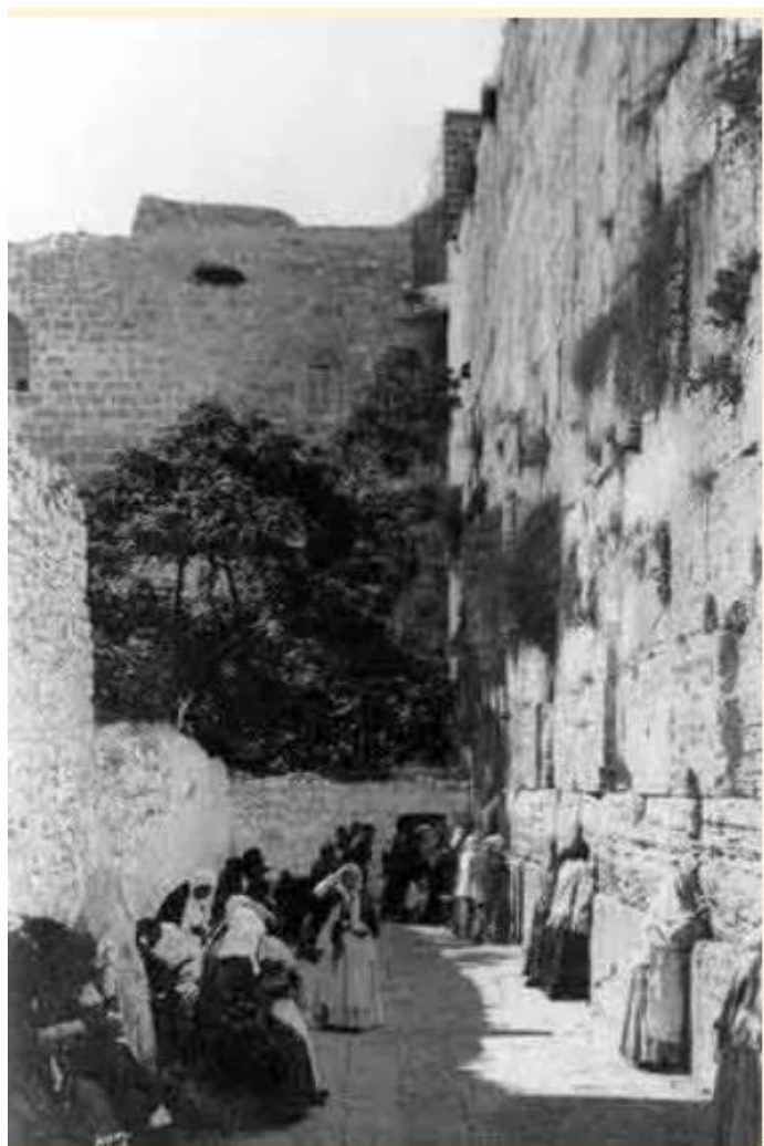
Photos of Jews praying at the Western Wall, circa early 20 th Century

Reprinted from the Parshat Matot-Masei 5783 edition of L’Chaim, a publication of the Lubavitch Youth Organization in Brooklyn, NY.