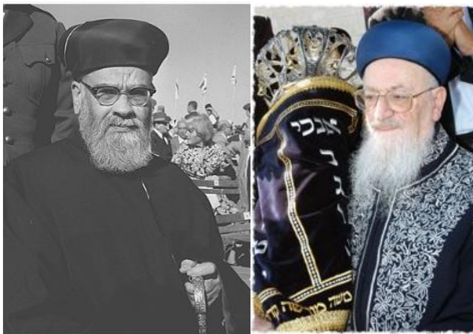
Rabbi Yitzhak Nissim and Rabbi Mordechai Eliyahu

Although the Patriarchs and Matriarchs are entombed in Marat HaMachpela (the Cave of the Patriarchs in Hebron), for 700 hundred years [1267-1967], the Muslims did not permit entry to the Jews, claiming that Avraham, Yitzhak and Yaakov belonged exclusively to them. They gave permission for Jews to ascend only until the seventh step of the outside Eastern stairway leading up to the tomb markers, and no further.