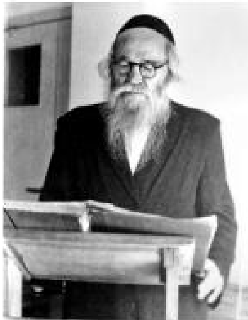
Rabbi Tzvi Pesach Frank

“Nitzachtani, you’ve won me over!” the man exclaimed and began to cry. Rav Tzvi Pesach was confused. All he had done was say shalom aleichem to the man, but he was afraid that he had triggered something painful.