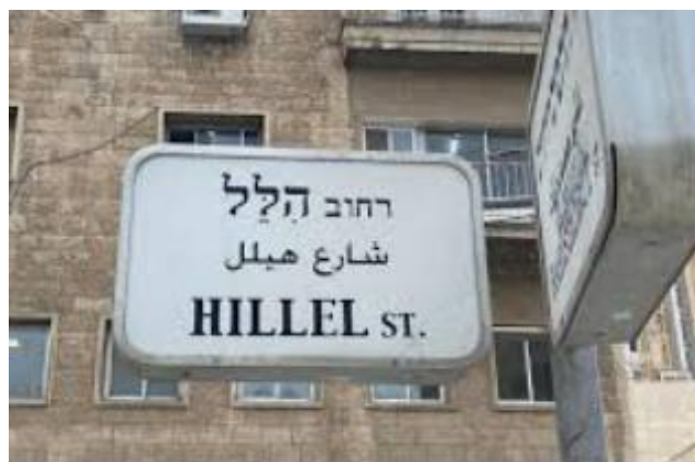
Hillel Street in Jerusalem

The man said, “I have a question to ask. Hillel said to him, “Ask, my son.” The man asked, “Why do the Tarmodian people have watery eyes?” Hillel again responded pleasantly and said, “My son, you have asked a significant question. The reason for this is because they live in a sandy area, and the sand gets into their eyes.”