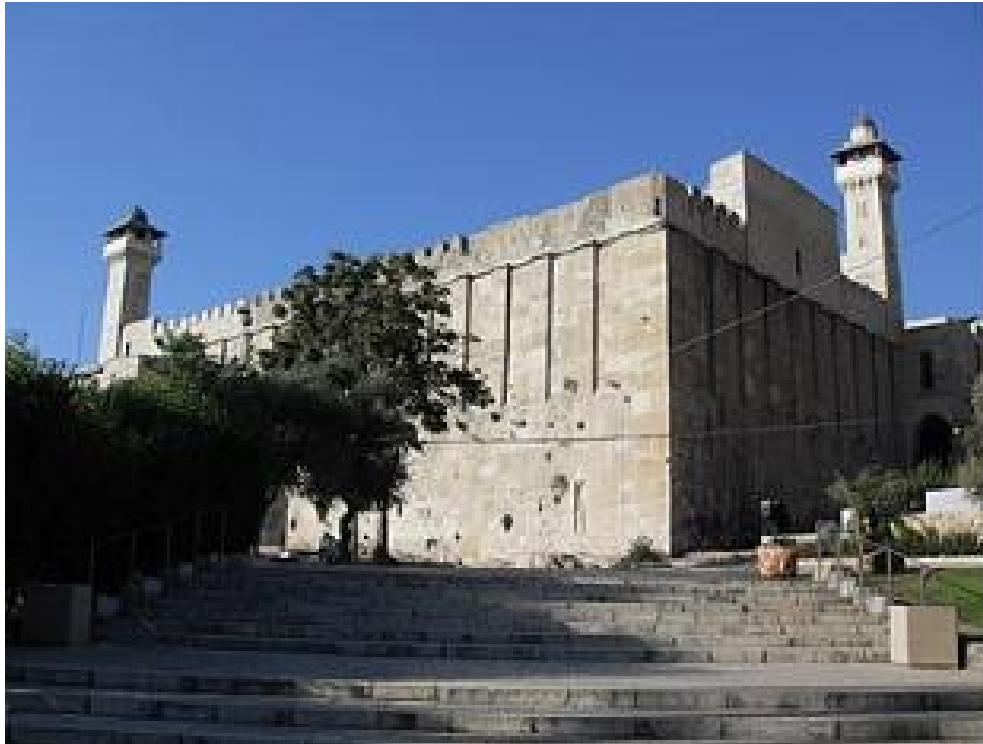
The outside of the Cave of the Patriarchs

When they were at the cave, a large group of soldiers entered. This was the first time anyone had been inside after the battles.