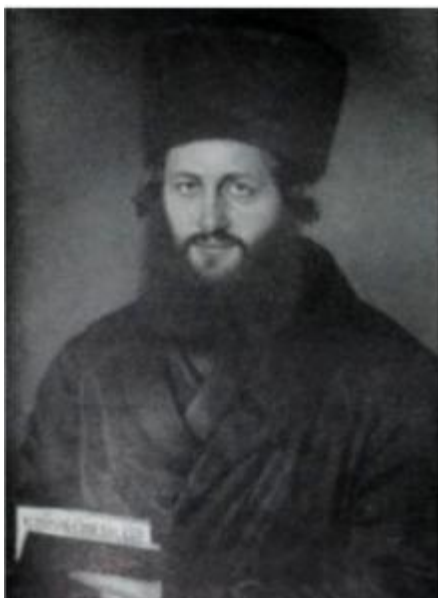
The Kesav Sofer

The Maharam Schik replied that he can't lend him the Sefer, but if he asks his Rebbi, the Kesav Sofer which Siman (chapter) he needs, he is happy to write it down for him. The student returned back shortly after with the correct Siman and the Maharam Schik wrote him the whole thing.