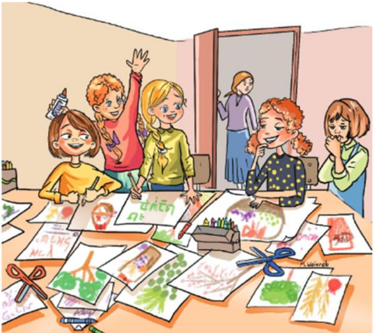
Illustrated by Miri Weinreb

were printed in all of the frum newspapers. Not only that, but the girls who made the most creative project would win a lifetime supply of bukser!