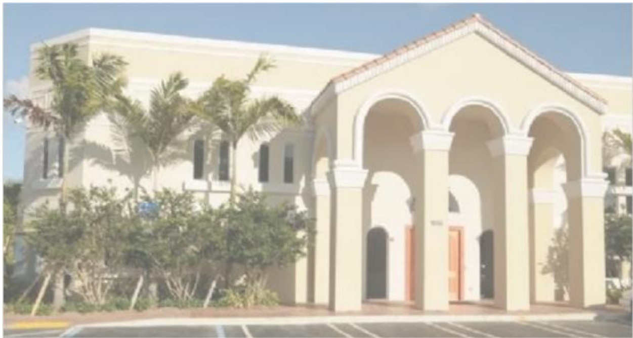
Chabad of Plantation, Florida

The shul was located in a strip mall near a Walgreens in Plantation, which I had never heard of. I had gotten lost going to Fort Lauderdale, and had the feeling that I'd have no chance finding this small shul in 25 minutes. So, I went slowly, driving from one block to the next and asking at each corner how to get closer to the strip mall near Walgreens.