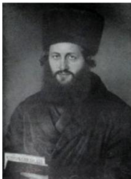
The Kesav Sofer

For, a few years the Kesav Sofer, Rav Avraham Shmuel Binyamin Sofer zt"l gave away time and energy to protect the Jewish traditional way of life. Finally, he succeeded that the Government recognized the Jewish education system.