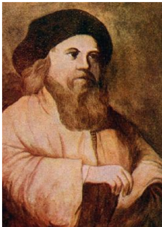
Painting of the Baal Shem Tov

When the Baal Shem Tov was about to pass away, he gathered together some of his close Talmidim and he told each one what their mission was going to be for the rest of their lives, in terms of spreading his teachings to others.