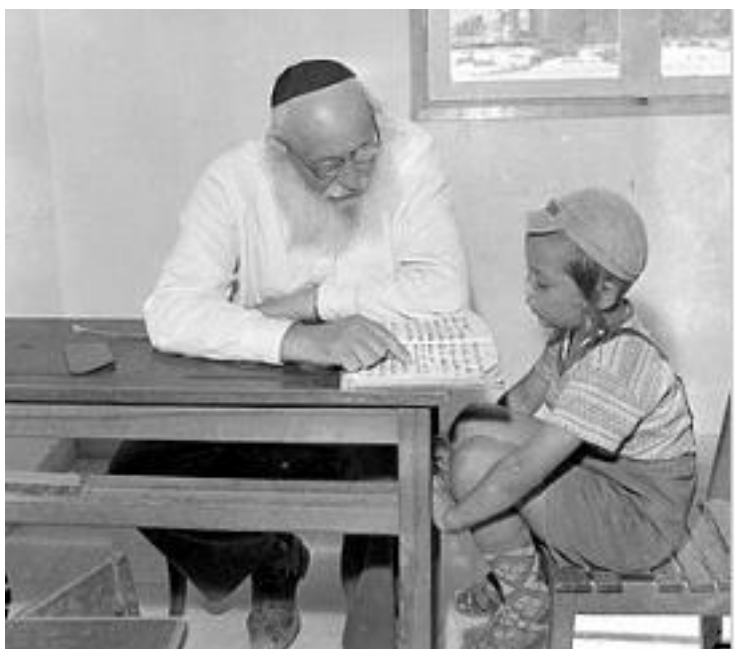
A cheder (classroom) in Bnei Brak, Israel, circa 1965