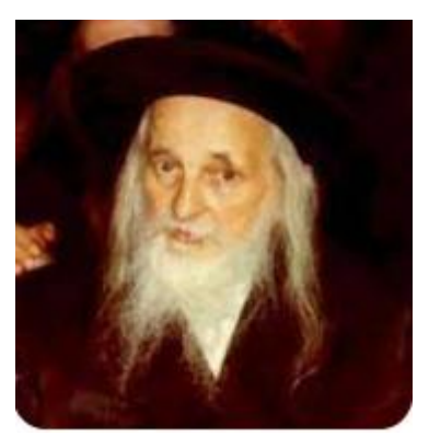
The Satmar Rebbe, zt"l

One of the Chasidim of the Satmar Rebbe, zt"l, worked in the jewelry exchange in Manhattan, New York. Once, when he was visiting the Rebbe, he asked the Rebbe for a Brachah that he have abundant Parnasah, and it should come easily.