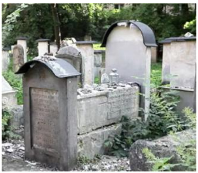
The Matzavah (tombstone of the Megaleh Amukos

A person should also get into the custom of praying for his needs in his own words. These tefillos can be said almost any time of the day, and they are precious tefillos to Hashem. One of the benefits of these tefillos is that they create a bond between the person and Hashem, as the following story demonstrated: