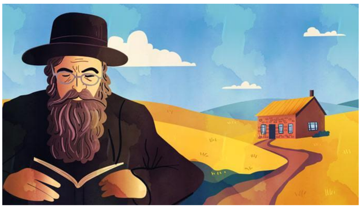
Art by Sefira Lightstone

Reb Pinchas Reizes seemed to be a man of contradictions.