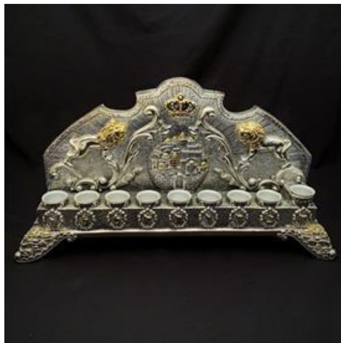
A Chanukah Menorah